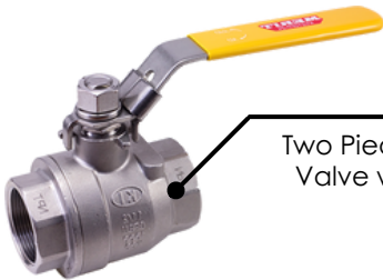
Two Piece Full Port 1000 WOG Ball Valve with Blow-Out Proof Stem