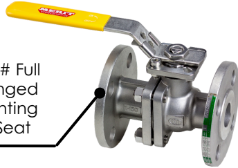
Two Piece 150# & 300# Full Port Direct Mount Flanged End Ball Valve | Mounting Pad | TFM 1600 Ball Seat