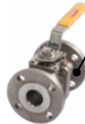
Two Piece 150# Full Port Bracket Mount Flanged End Ball Valve | Mounting Pad | TFM 1600 Ball Seat