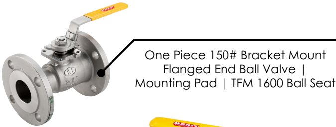
One Piece 150# Bracket Mount Flanged End Ball Valve | Mounting Pad | TFM 1600 Ball Seat